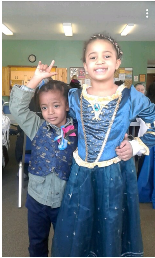
Messy Church continues. The February session is pictured above, and the March one below and opposite.